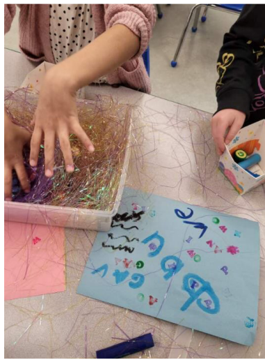
YFNED and FNSB teams play fun literacy activities with gr. 1 students at Johnson Elementary School.

The literacy assessments will be completed again this spring, and results from these assessments will be shared with parents.