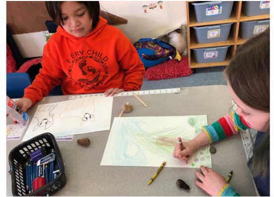
Students at Grey Mountain Primary participate in the FNSB Logo Workshop.